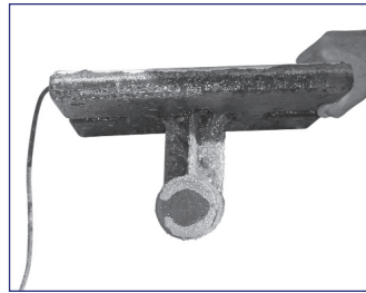
Before cleaning the face of the transducer

We recommend that at least every 30 days you unplug your SonicSolutions ® device, take it out of the water, wipe the face of the transducer off, put it back into the water and plug it back in.