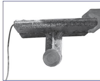
After cleaning the face of the transducer